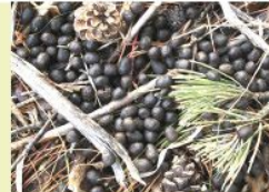
SCAT (ANIMAL POOP)