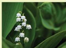
LILIES OF THE VALLEY